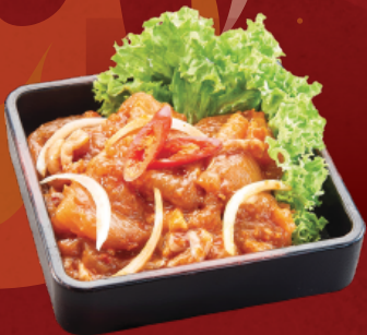
Spicy Bulgogi Chicken 100g RM 10 200g RM 14