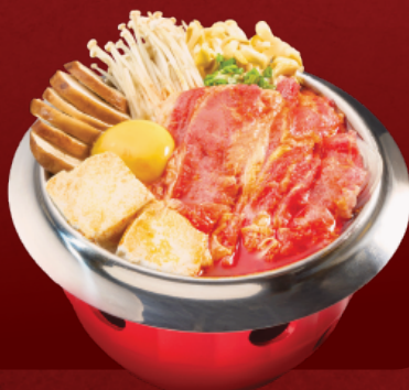
Spicy Soon Dubu Beef Hot Pot RM 34