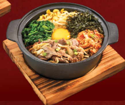
Chicken Bulgogi Bap RM 21