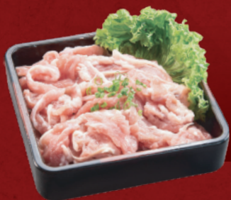
Special Marinated Beef 100g RM 14 200g RM 21