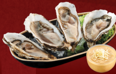
Korean Oyster with Cheese Dip