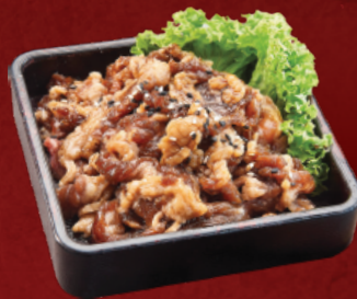
Keopi Beef 100g RM 14 200g RM 21