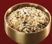
Upgrade to Kimgaru Rice RM 3