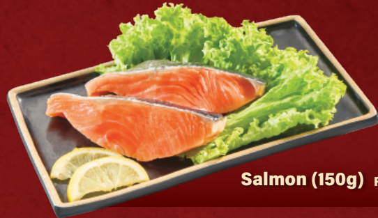
Salmon (150g) RM 18