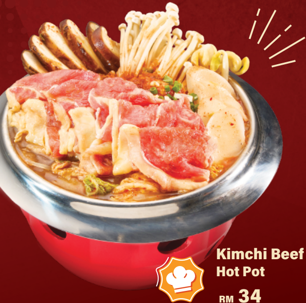
Kimchi Beef Hot Pot RM 34