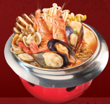
Kimchi Seafood Hot Pot RM 32