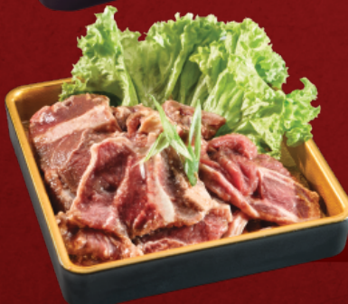
Bulgogi Lamb Shoulder (200gm) RM 28