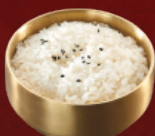
White Rice RM 3