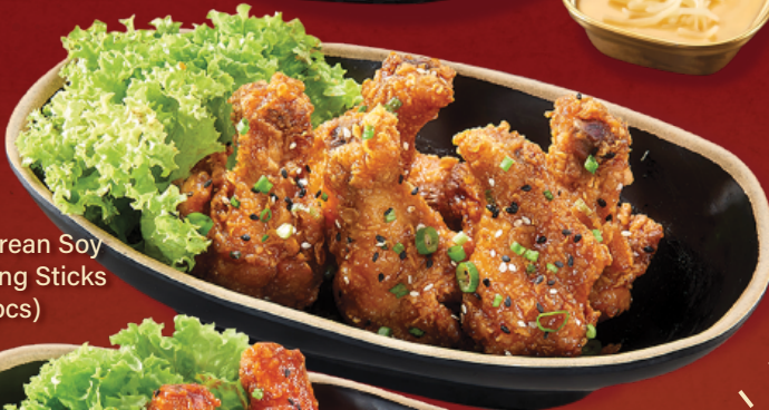
Korean Soy Wing Sticks (5pcs)