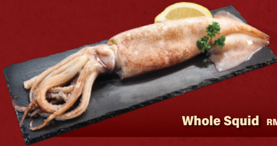
Whole Squid RM 18