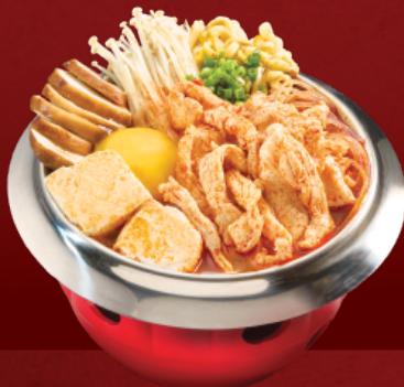
Spicy Soon Dubu Chicken Hot Pot RM 28