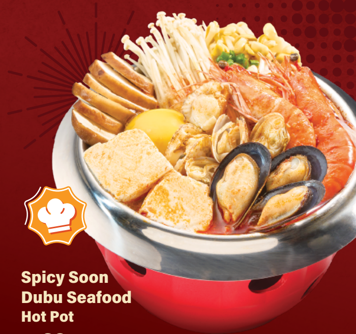
Spicy Soon Dubu Seafood Hot Pot RM 32