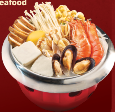
Non-Spicy Soon Dubu Seafood Hot Pot RM 32