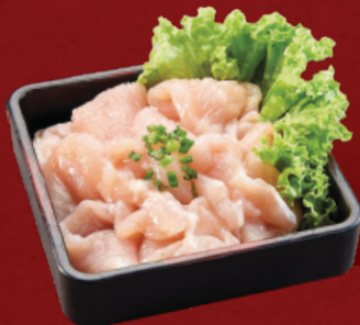
Special Marinated Chicken 100g RM 10 200g RM 14