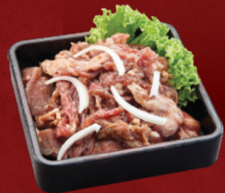
Bulgogi Beef 100g RM 14 200g RM 21