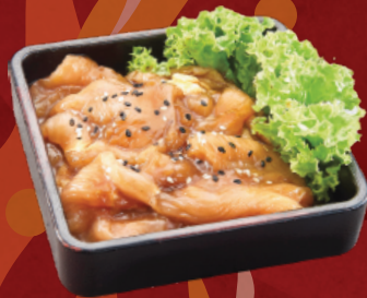
Keopi Chicken 100g RM 10 200g RM 14