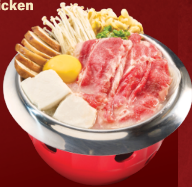
Non-Spicy Soon Dubu Chicken Hot Pot RM 28