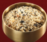
Kingaru Rice RM 6