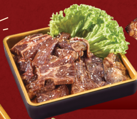
Keopi Lamb Shoulder (200gm) RM 28