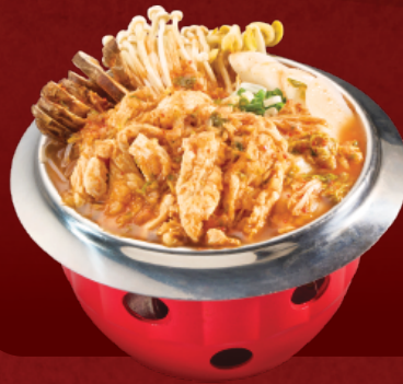
Kimchi Chicken Hot Pot RM 28