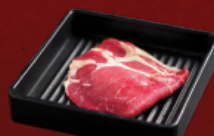
Beef Striploin (50gm) RM 6