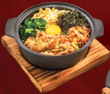
Chicken Bulgogi Bap RM 21