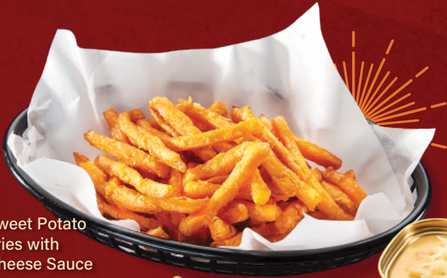
Sweet Potato Fries with Cheese Sauce

Lettuce Wrap + 3-in-1 Namul + Kimgaru Rice RM 10