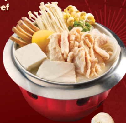
Non-Spicy Soon Dubu Beef Hot Pot RM 34