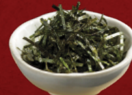
Seaweed RM 2