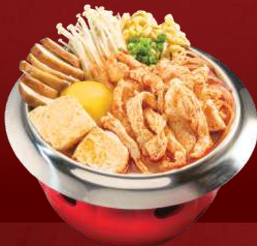
Spicy Soon Dubu Chicken Hot Pot RM 28