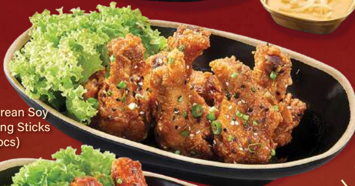
Korean Soy Wing Sticks (5pcs)