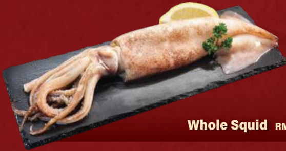
Whole Squid RM 18