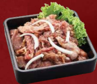
Bulgogi Beef 100g RM 14 200g RM 21