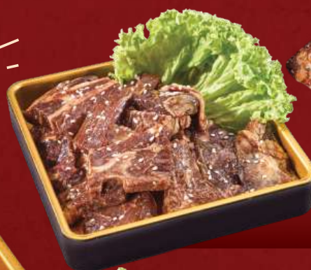
Keopi Lamb Shoulder (200gm) RM 28