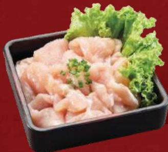
Special Marinated Chicken 100g RM 10 200g RM 14