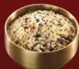
Kingaru Rice RM 6