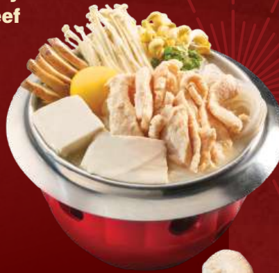
Non-Spicy Soon Dubu Beef Hot Pot RM 34