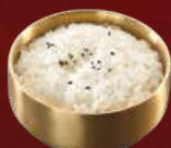
White Rice RM 3