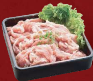
Special Marinated Beef 100g RM 14 200g RM 21