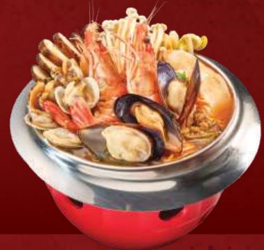
Kimchi Seafood Hot Pot RM 32