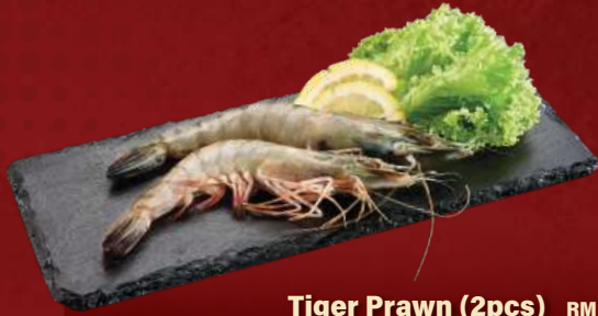
Tiger Prawn (2pcs) RM 18