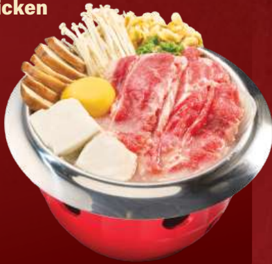
Non-Spicy Soon Dubu Chicken Hot Pot RM 28