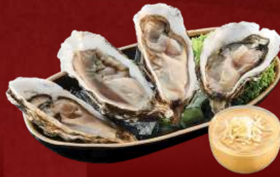
Korean Oyster with Cheese Dip