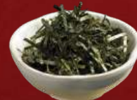
Seaweed RM 2