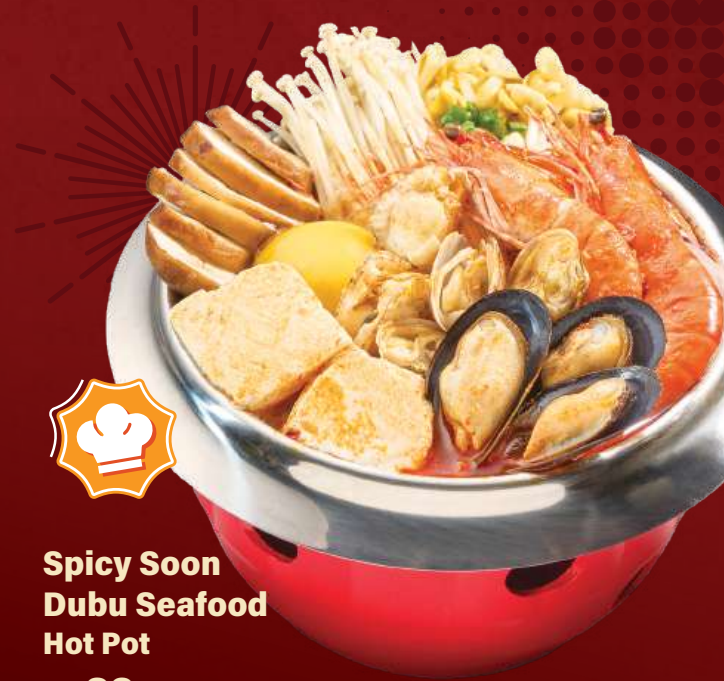
Spicy Soon Dubu Seafood Hot Pot RM 32