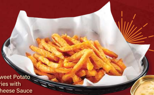
Sweet Potato Fries with Cheese Sauce

Lettuce Wrap + 3-in-1 Namul + Kimgaru Rice RM 10