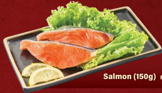
Salmon (150g) RM 18