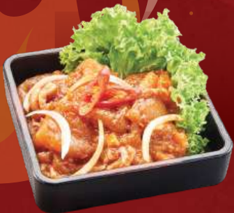
Spicy Bulgogi Chicken 100g RM 10 200g RM 14