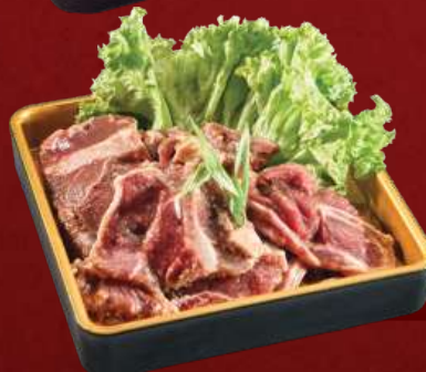
Bulgogi Lamb Shoulder (200gm) RM 28