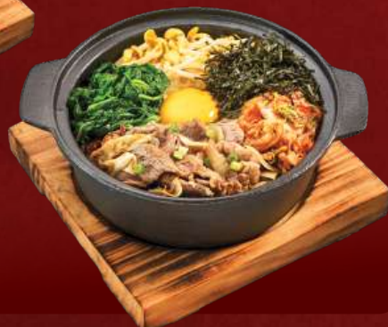
Chicken Bulgogi Bap RM 21