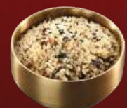
Upgrade to Kimgaru Rice RM 3