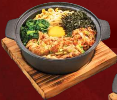
Chicken Bulgogi Bap RM 21