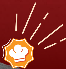
Kalbi Short Rib