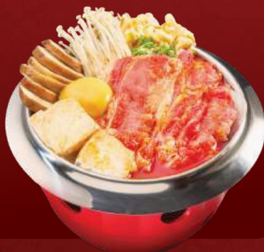
Spicy Soon Dubu Beef Hot Pot RM 34