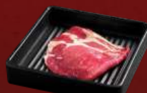
Beef Striploin (50gm) RM 6