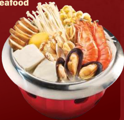
Non-Spicy Soon Dubu Seafood Hot Pot RM 32