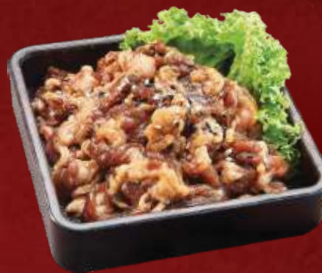
Keopi Beef 100g RM 14 200g RM 21