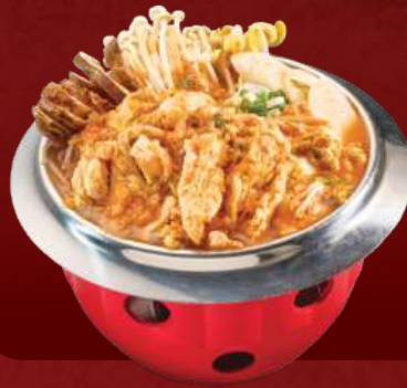
Kimchi Chicken Hot Pot RM 28