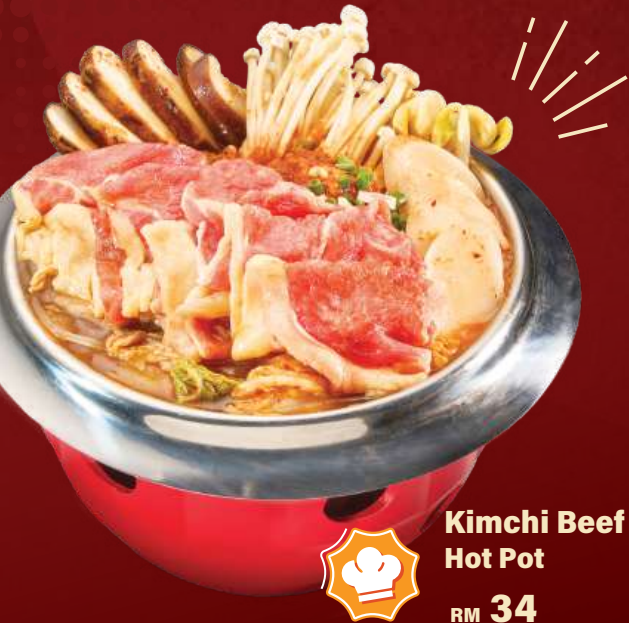
Kimchi Beef Hot Pot RM 34