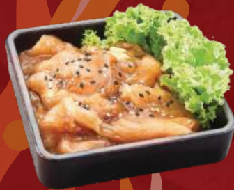
Keopi Chicken 100g RM 10 200g RM 14