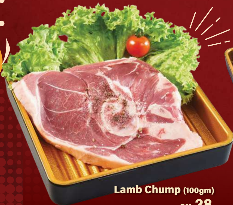
Lamb Chump (100gm) RM 28